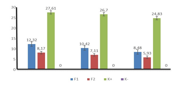
Figure 2. Antibacterial of Synbiotic Coffee against E. coli F1: Sancaco robusta coffee, chicory inulin, B. bifidum powder, and glucose. F2: Pure Sancaco robusta coffee (without mixture) K+: Ciprofloxacin antibiotic tablet solution

Antibacterial testing used samples from the viability test results, namely the control treatment of formula 1 plain water at 40°C which had been stored from 7 days to 21 days, the positive control used was ci ciprofloxacin antibiotic tablets, the negative control was sterile distilled water, and the control treatment 2 was Robusta coffee. Pure temperature 40°C. The purpose of this antibacterial test is to see the effect of synbiotic coffee bacteria inhibition on E. coli diarrhea bacteria with a storage period of 21 days or 3 weeks.